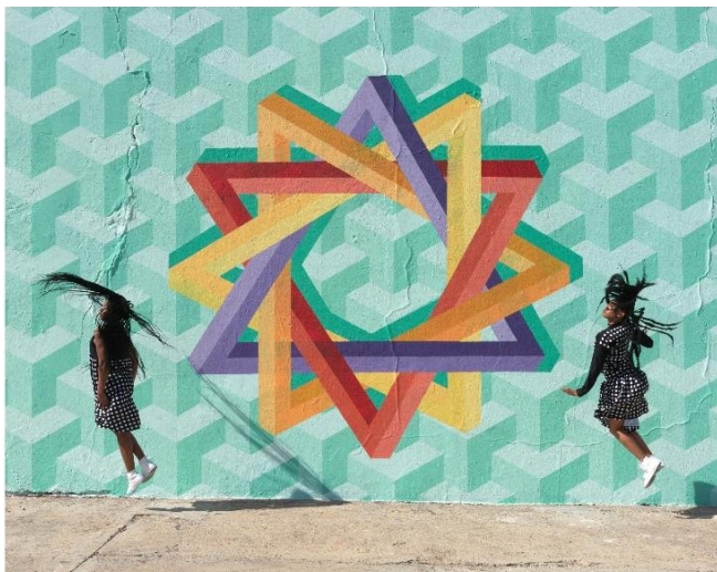
Robin Rhode, Delta , 2018 4 C-prints each: 58,6 x 72,6 cm © Courtesy of the artist