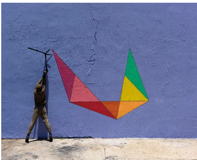
Robin Rhode, Paradise , 2016 8 individual C - prints each: 56 cm x 70 cm / 58,6 cm x 72,6 cm (framed) © Courtesy of the artist