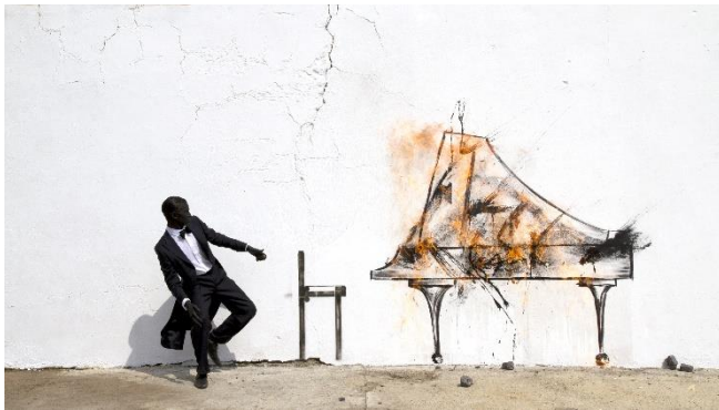
Robin Rhode, Piano Chair , 2011 Digital Animation 03:53 Min