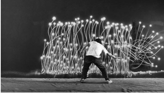
Robin Rhode, Harvest , 2005 Digital Animation 03:45 Min