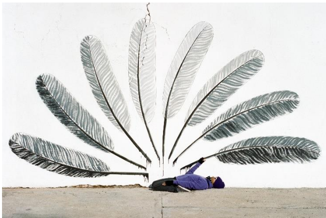
Robin Rhode, Twilight , 2012 8 individual C - prints each: 41.59 cm x 61.59 cm (framed)