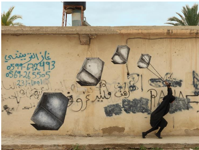
Robin Rhode, Melancholia , 2019 4 C - Prints each: 54,6 x 72,6 cm