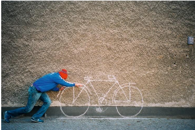
Robin Rhode, Classic Bike , 2002 12 Diasecs each: 29,8 x 45,7 cm