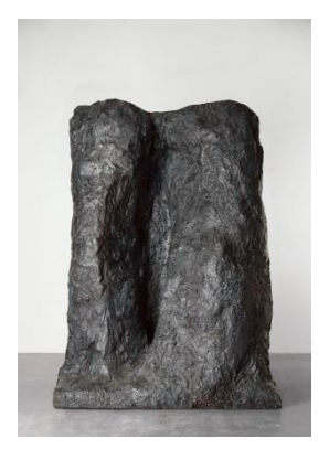
Per Kirkeby, Gate I, 1987 Bronze, 220\times150\times75 cm, ed.: 4/6 © Per Kirkeby Estate Courtesy Galerie Michael Werner, Märkisch Wilmersdorf, Cologne & New York

The exhibition at the Kunsthalle Krems ends with the juxtaposition of a monumental painting from the 1980s in panorama format with a bronze cast sculpture from the same decade. Kirkeby was a peintre-sculpteur in the classical sense. His bronzes developed out of the paintings. The bronze texture is reticulated with expressive cracks, which correlates with the informalist, jerky surfaces of the painted pictures. It is a processual sculptured expression in plaster and clay, an adding and removing, forming and deforming. The exhibition also includes smaller bronzes; in part, they have the shape of arms, legs, and torsos, which mutate into something more plant-like and natural.