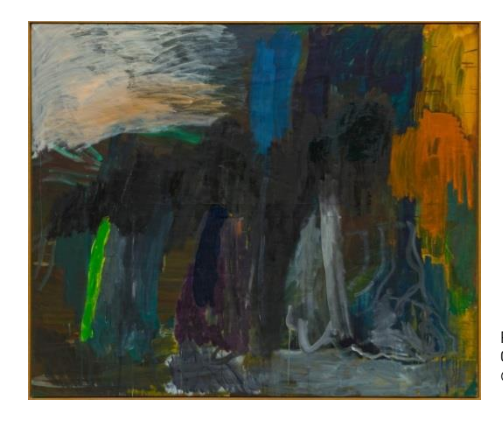
Per Kirkeby, Untitled, 1986 Oil on canvas, 200 × 240 cm

The exhibition of Per Kirkeby at the Kunsthalle Krems starts out with a representative selection of paintings from the 1980s, 1981 to '86. It is a time in which Kirkeby brings tectonics, structure, and multiple color layers to his painting, and his painterly work consolidates. A tension-charged interplay between constructivist clarity and the emotional-intuitive unfolds. Nature and landscape rather define the picture area as a field, a rhythmic array with dissonantly interspersed breaks. It was particularly the paintings from the 1980s that were characterized by a subdued, broken overall atmosphere; they speak of the darkness of the north.