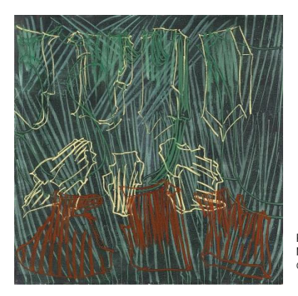
Per Kirkeby, Untitled, 1999 Mixed media on Masonite, 122 × 122 cm