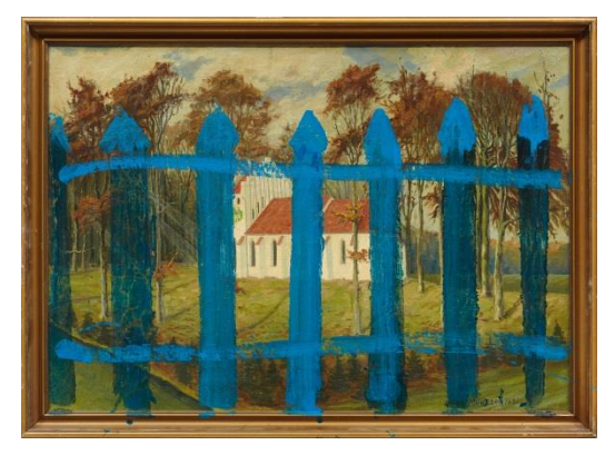
Per Kirkeby, Untitled, 2013 Overpainting, oil on canvas, 58 × 81 cm

on "Overpaintings," the artist writes that he saw this as a "striving towards the true essence of the picture in question. It's much like painting your 'own' pictures."