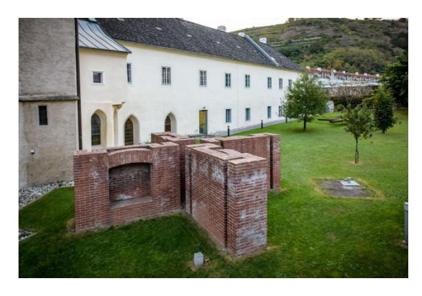
Per Kirkeby, Untitled , 1993-95 Brick sculpture in the sculpture garden of the Minorite Church Bricks, 210 x 300 x 87 cm (per wall element) © Per Kirkeby Estate Courtesy Galerie Michael Werner, Märkisch Wilmersdorf, Cologne & New York, Photo: Sascha Osaka / NÖ Festival

At first sight, the group of brick sculptures appear like a foreign body in Kirkeby's oeuvre. They are slightly reminiscent of Minimal Art, of Carl Andre's uniform non-relational series of floor tiles or Donald Judd's serialized wall works. On the other hand, they evoke associations of buildings, if without practical usability; absurd structures between sculpture and architecture. And they also have an autobiographical aspect to them, because Kirkeby grew up in a red brick housing estate in Copenhagen.