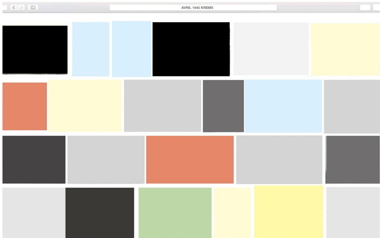
Perrine Lacroix, Google search AVRIL 45 KREMS , 2017, wall paintings, various dimensions, Photo: Perrine Lacroix