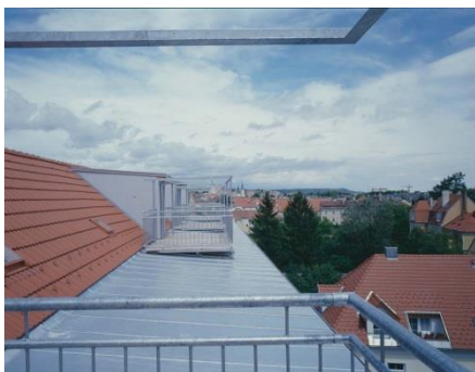
Studios of AIR – ARTIST IN RESIDENCE Niederösterreich

45 artists are visiting as artists-in-residence in Krems this year. By December 2018, there will have been a total of 799 scholarship holders from 70 countries who have been guests as part of the AIR - ARTIST IN RESIDENCE programme.