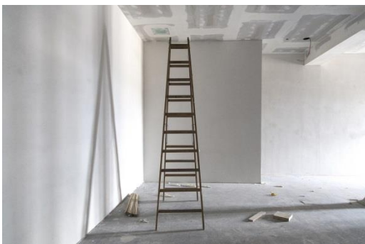
Perrine Lacroix In progress , Kunsthalle Krems 2017 photography, 260 x 125 cm