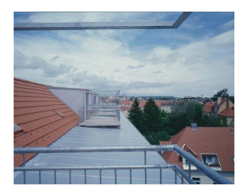
Studios of AIR – ARTIST IN RESIDENCE Niederösterreich

45 artists are visiting as artists-in-residence in Krems this year. By December 2018, there will have been a total of 799 scholarship holders from 70 countries who have been guests as part of the AIR - ARTIST IN RESIDENCE programme.