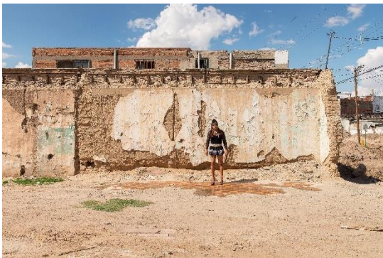
Teresa Margolles, Patty, Pista de Baile del Club "Hollywood" , 2016 Fotografie / Photography 180 x 120 cm Foto / Photo: Teresa Margolles