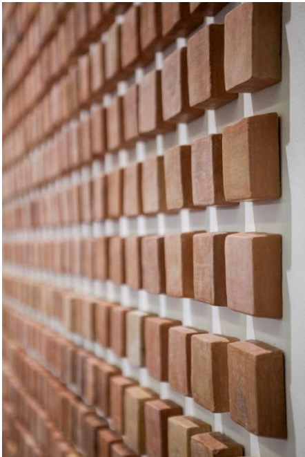
Teresa Margolles, La Gran América , 2017