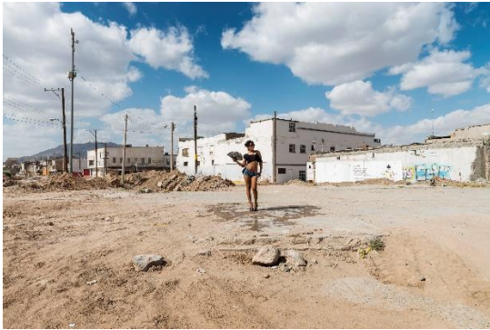
Teresa Margolles, Scarlett, Pista de Baile del Club "La Cruda" , 2016 Fotografie / Photography 180 x 120 cm