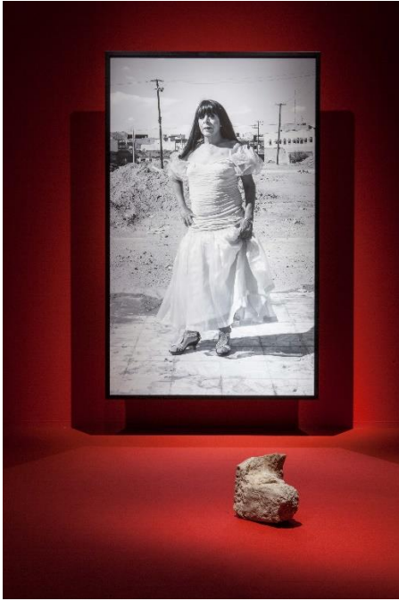
Teresa Margolles, Karla, Hilario Reyes Gallegos , 2016 B/w print: 242 x 153 cm, framed Facsimile: 32 x 26 cm, framed Found object: 21 x 38 x 12 cm