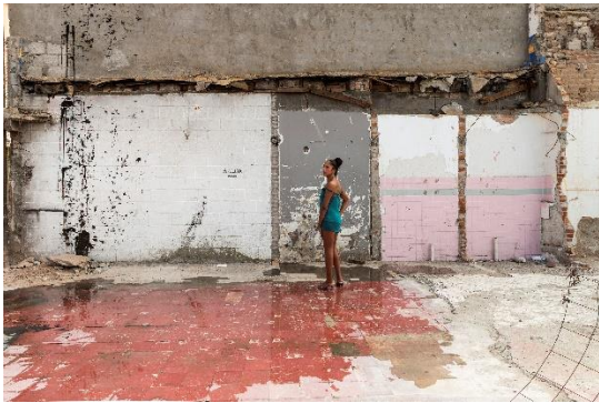
Teresa Margolles, Berenice, Pista de Baile del Club "Tlaquepaque" , 2016 Fotografie / Photography 180 x 120 cm