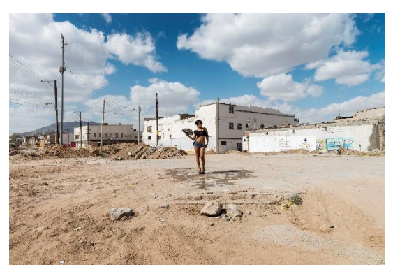
Teresa Margolles, Scarlett, Pista de Baile del Club "La Cruda" , 2016 Fotografie / Photography 180 x 120 cm Foto / Photo: Teresa Margolles