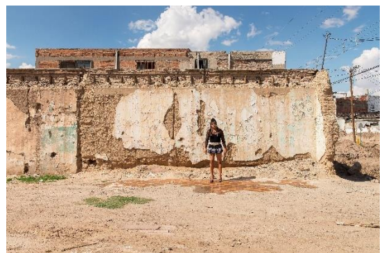
Teresa Margolles, Patty, Pista de Baile del Club "Hollywood" , 2016 Fotografie / Photography 180 x 120 cm