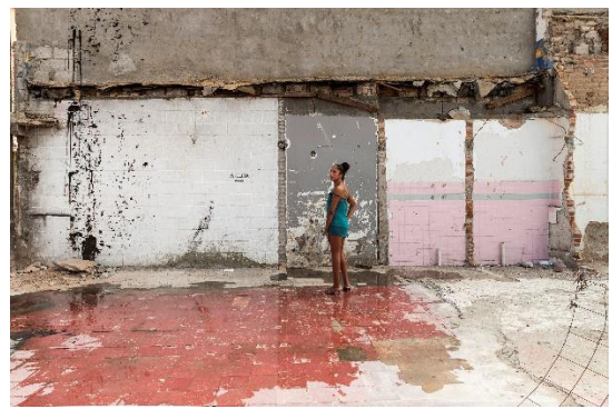
Teresa Margolles, Berenice, Pista de Baile del Club "Tlaquepaque" , 2016 Fotografie / Photography 180 x 120 cm