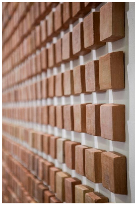
Teresa Margolles, La Gran América , 2017 Foto / Photo: Rafael Burillo

Teresa Margolles, Karla, Hilario Reyes Gallegos , 2016 B/w print: 242 × 153 cm, framed Facsimile: 32 × 26 cm, framed Found object: 21 x 38 x 12 cm Foto / Photo: Rafael Burillo