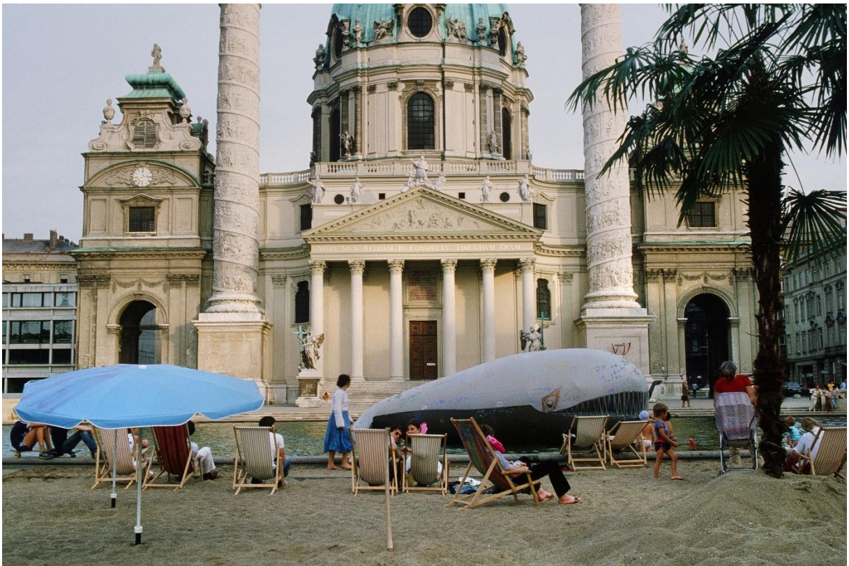
Margot Pilz, Kaorle am Karlsplatz, 1982