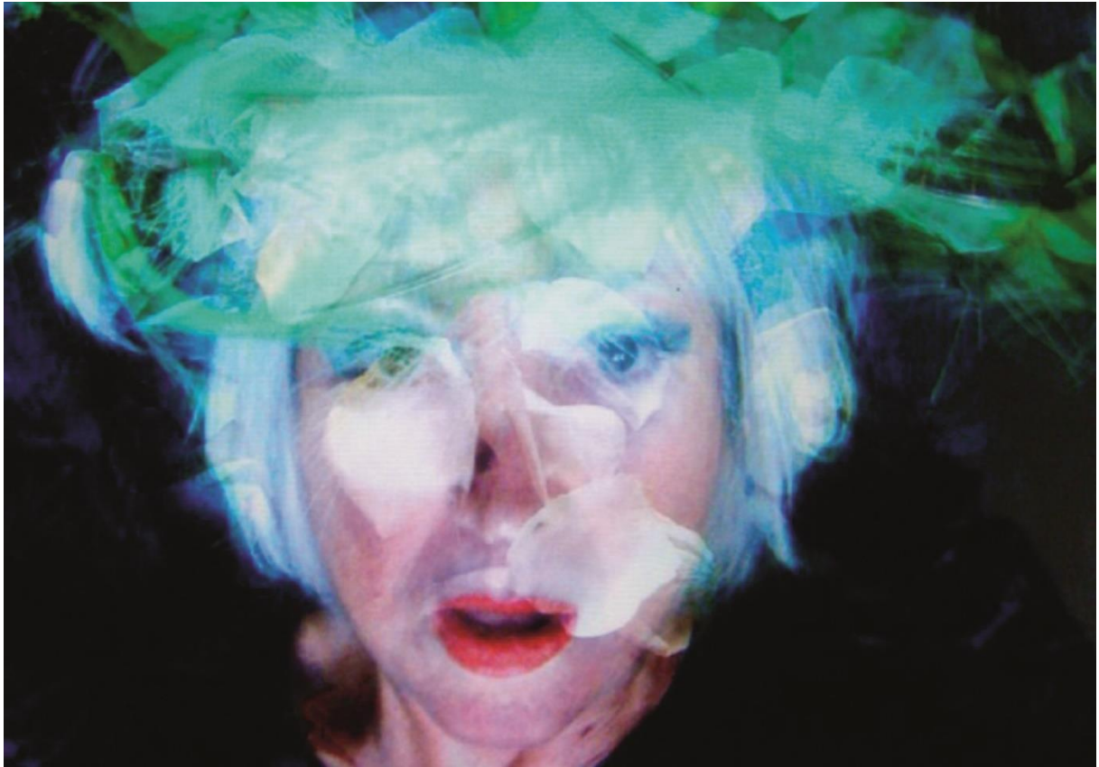
Margot Pilz, Celebration, 2011/12 (Filmstill) © Margot Pilz, cooperation: Victoria Coeln courtesy of Galerie 3