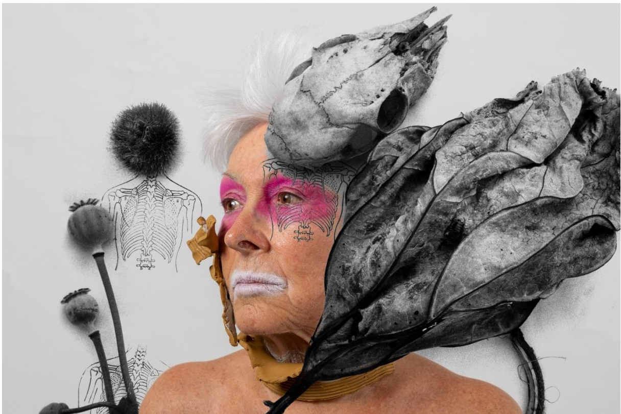
Margot Pilz, Transition 1, 2021 © Margot Pilz graphic design: Helmut Prochart