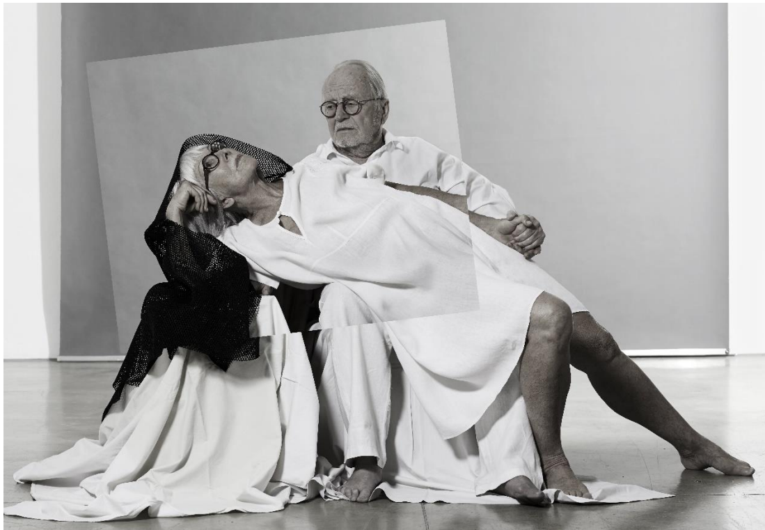
Margot Pilz, Pietà 1, 2018