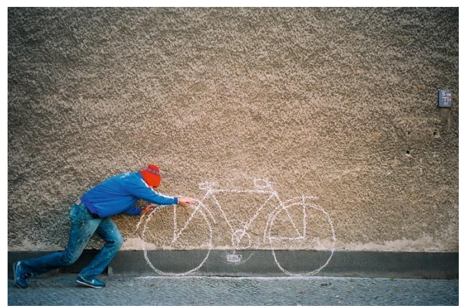
Robin Rhode, Classic Bike , 2002 12 Diasecs each: 29,8 x 45,7 cm © Courtesy of the artist