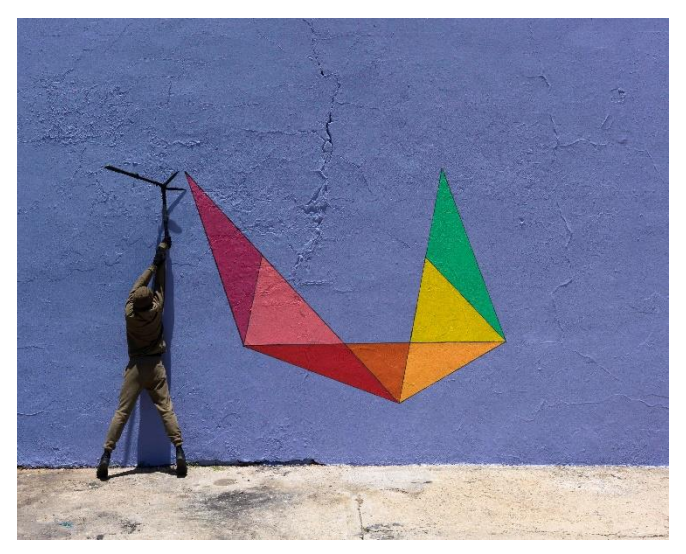
Robin Rhode, Paradise , 2016 8 individual C - prints each: 56 cm x 70 cm / 58,6 cm x 72,6 cm (framed)