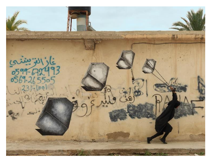
Robin Rhode, Melancholia , 2019 4 C - Prints each: 54,6 x 72,6 cm