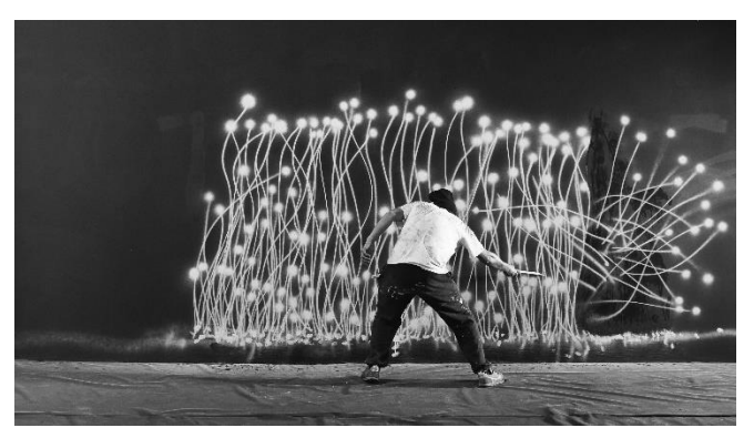
Robin Rhode, Harvest , 2005 Digital Animation 03:45 Min © Courtesy of the artist