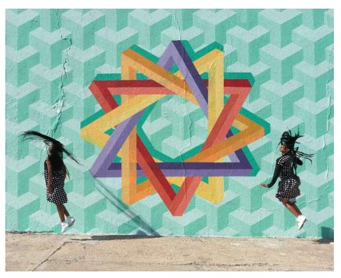
Robin Rhode, Delta , 2018 4 C-prints each: 58,6 x 72,6 cm