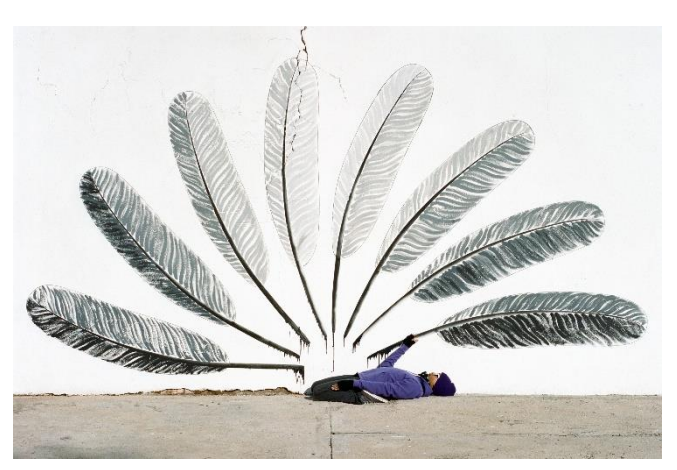
Robin Rhode, Twilight , 2012 8 individual C - prints each: 41.59 cm x 61.59 cm (framed)