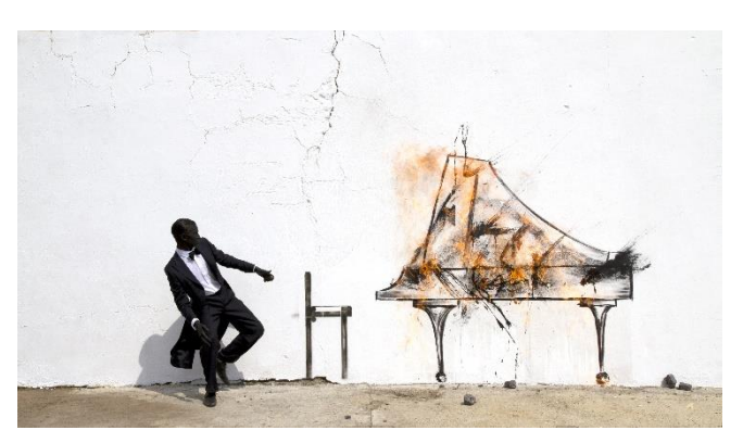
Robin Rhode, Piano Chair , 2011 Digital Animation 03:53 Min