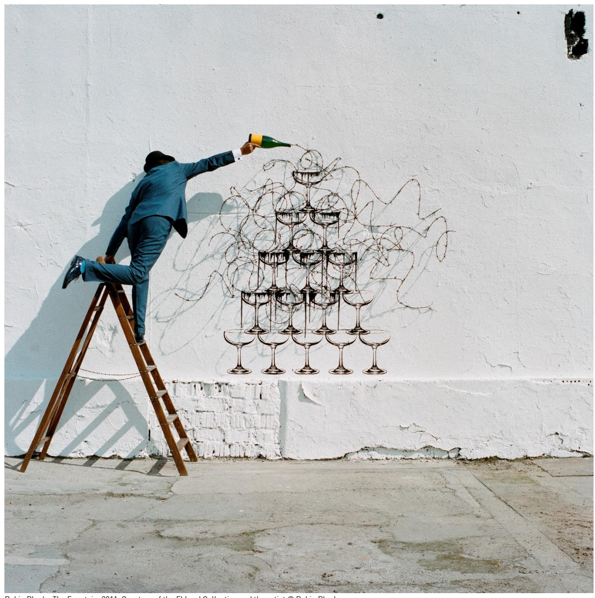
Robin Rhode, The Fountain, 2011, Courtesy of the Ekhard Collection and the artist © Robin Rhode

OPENING: Friday, 13.03.2020, 7 pm PRESS CONFERENCE: Friday, 13.03.2020, 11 am