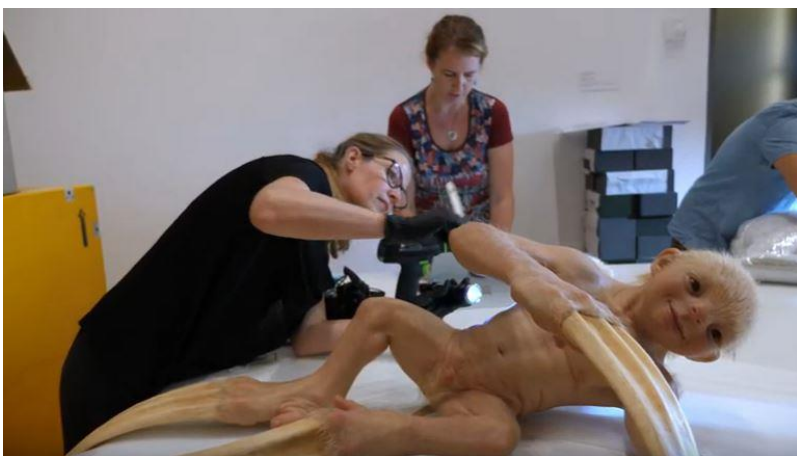
GO BEHIND THE SCENES AS WE INSTALL PATRICIA PICCININI 'CURIOUS AFFECTION'

https://www.youtube.com/watch?v=m8Rqhi4vLT0