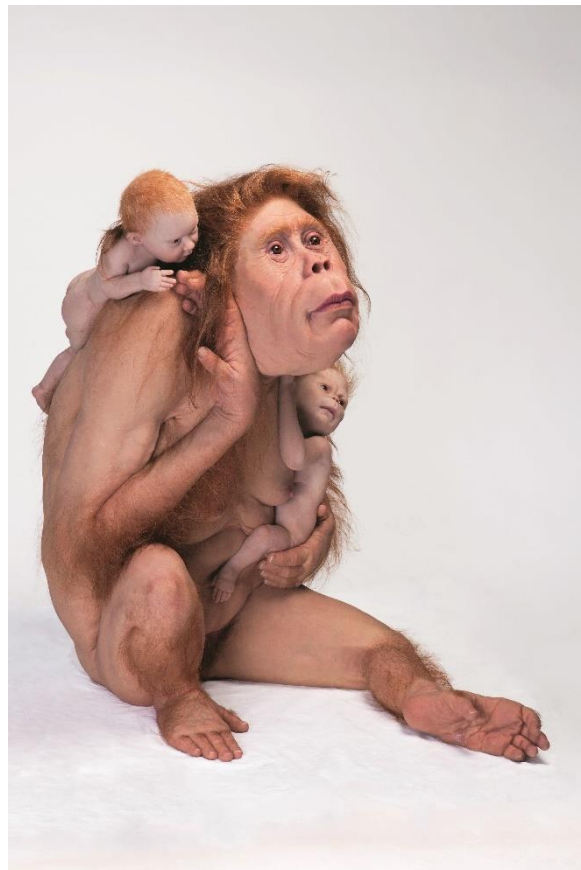
Patricia Piccinini, Kindred , 2018.