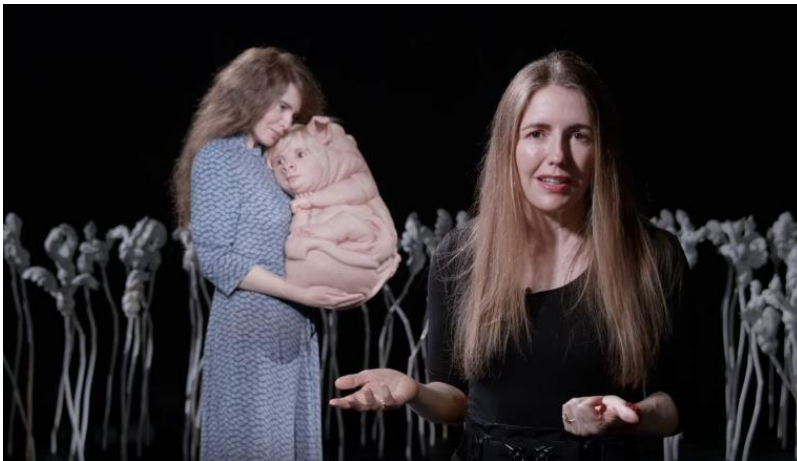
WALK WITH PATRICIA PICCININI THROUGH HER EXHIBITION 'CURIOUS AFFECTION'

https://www.youtube.com/watch?v=Swx7ewLxyfw