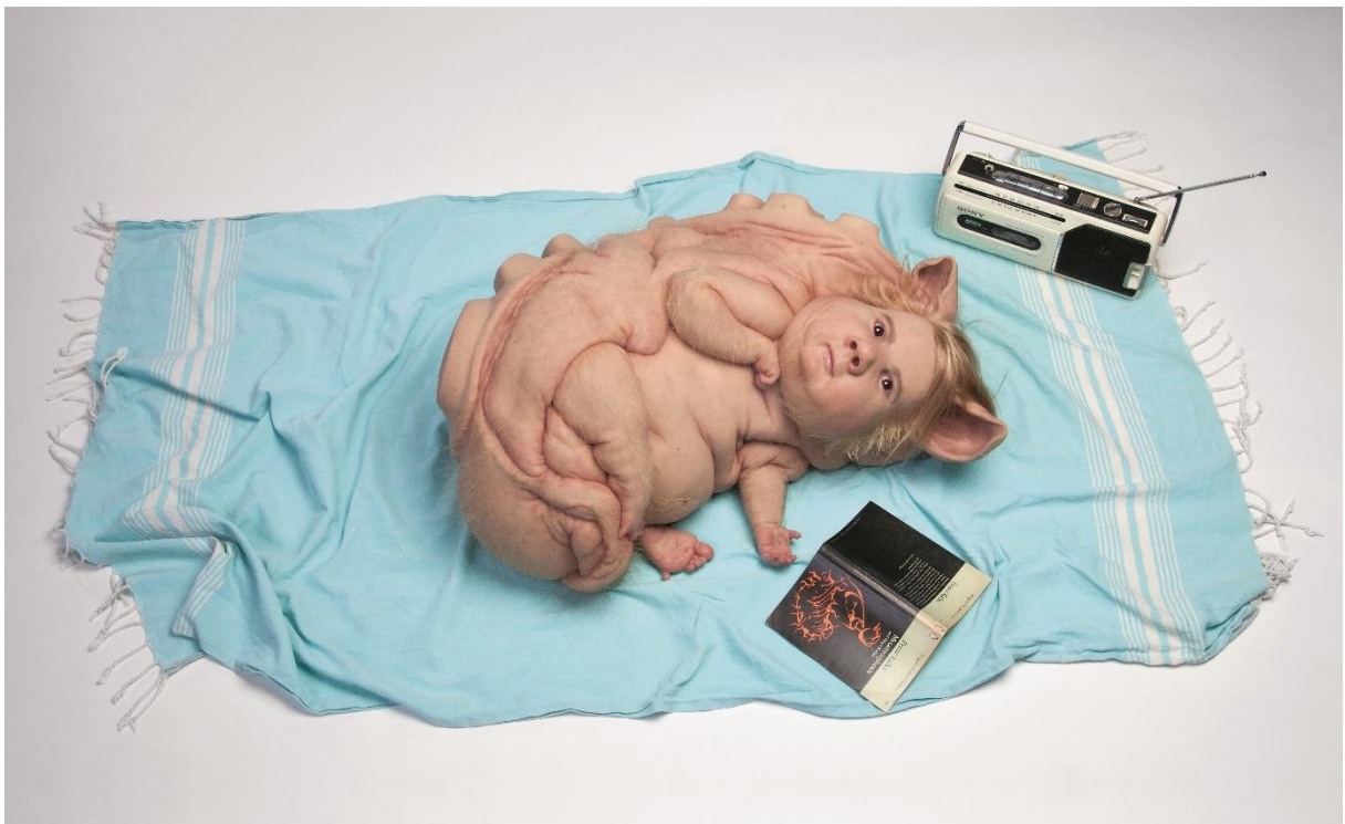
Patricia Piccinini, Teenage Metamorphosis , 2017.