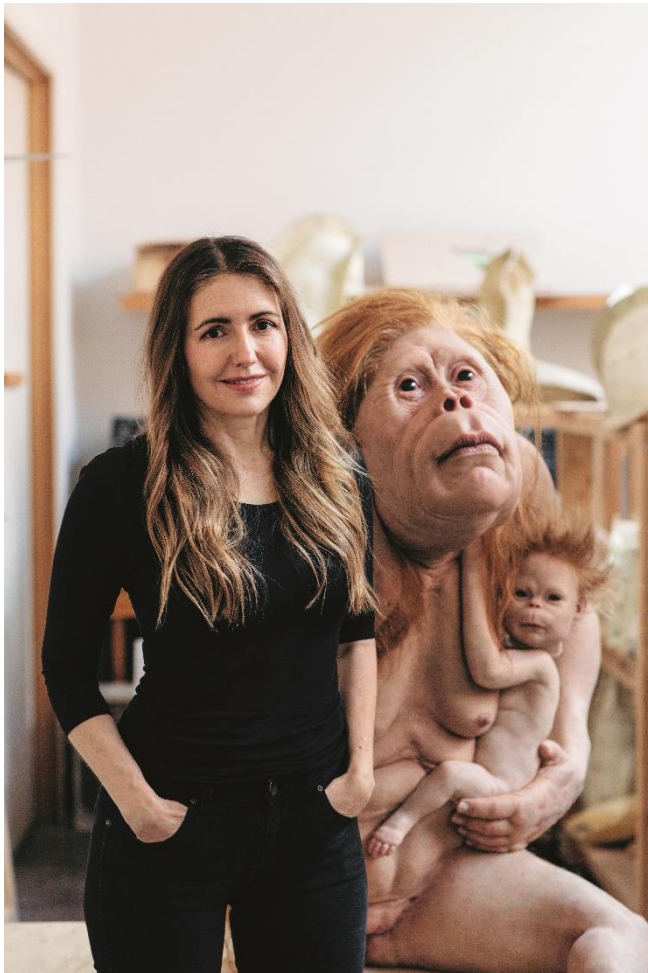
Patricia Piccinini, 2018

Piccinini's work is held in a number of museum collections such as ARKEN Museum of Modern Art (Copenhagen, DK), Middelheim Museum (Antwerp, BE), Monash University Museum of Art (Victoria, AU), National Gallery of Australia (Canberra, AU), National Museum of Women in the Arts (Washington DC, US), Phenix Art Museum (Phenix, US) and Queensland Art Gallery (Brisbane, AU).