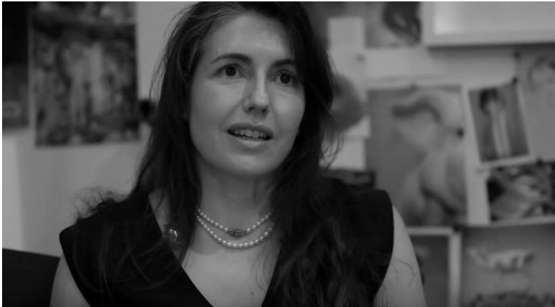
PATRICIA PICCININI – THE ARTIST IN HER STUDIO

https://www.youtube.com/watch?v=Swx7ewLxyfw