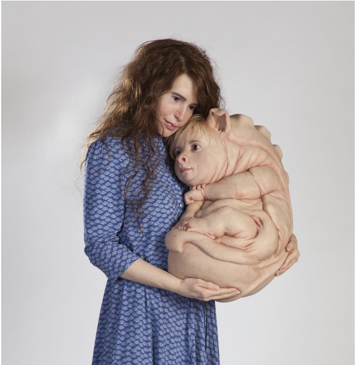
Patricia Piccinini, The Bond, 2016, Courtesy of the artist.

PATRICIA PICCININI. EMBRACING THE FUTURE 27.03. – 03.10.2021 Kunsthalle Krems