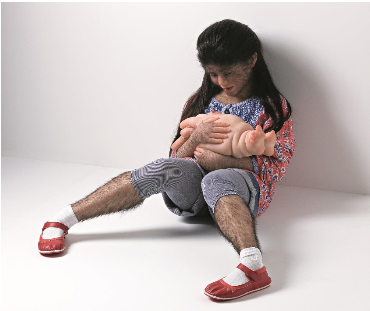
Patricia Piccinini, The Comforter , 2010.