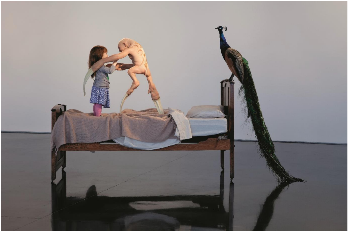
Patricia Piccinini, The Welcome Guest , 2011. Courtesy of the artist.