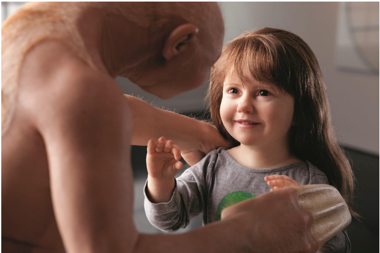
Patricia Piccinini, The Welcome Guest , 2011. (Detail)