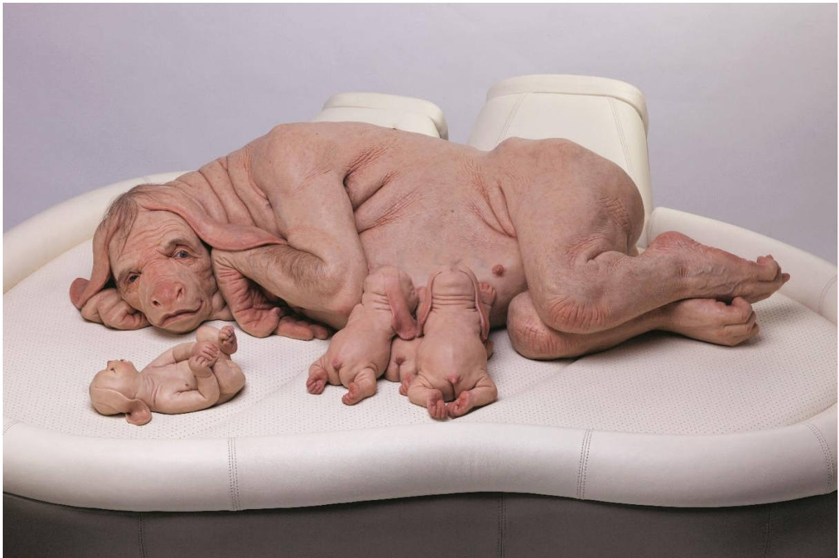
Patricia Piccinini, The Young Family , 2002.