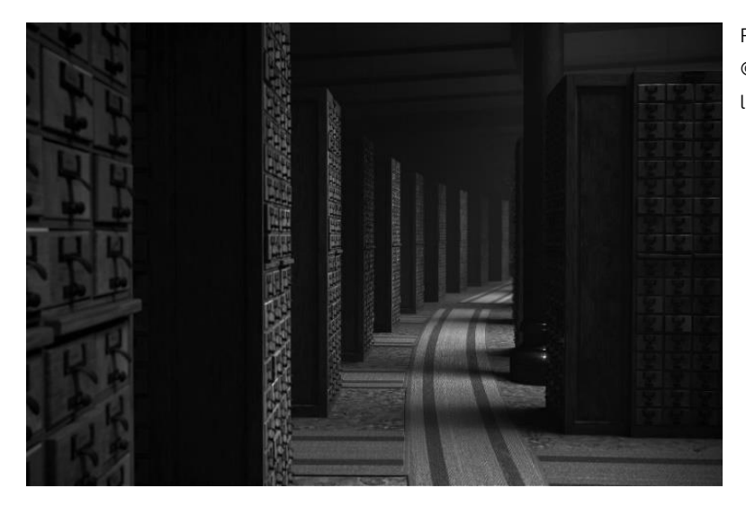
Fiona Tan, Archive, 2019 (Filmstill)