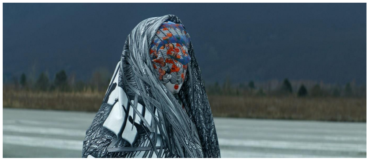
Metahaven, Possessed, 2018 (Filmstill)