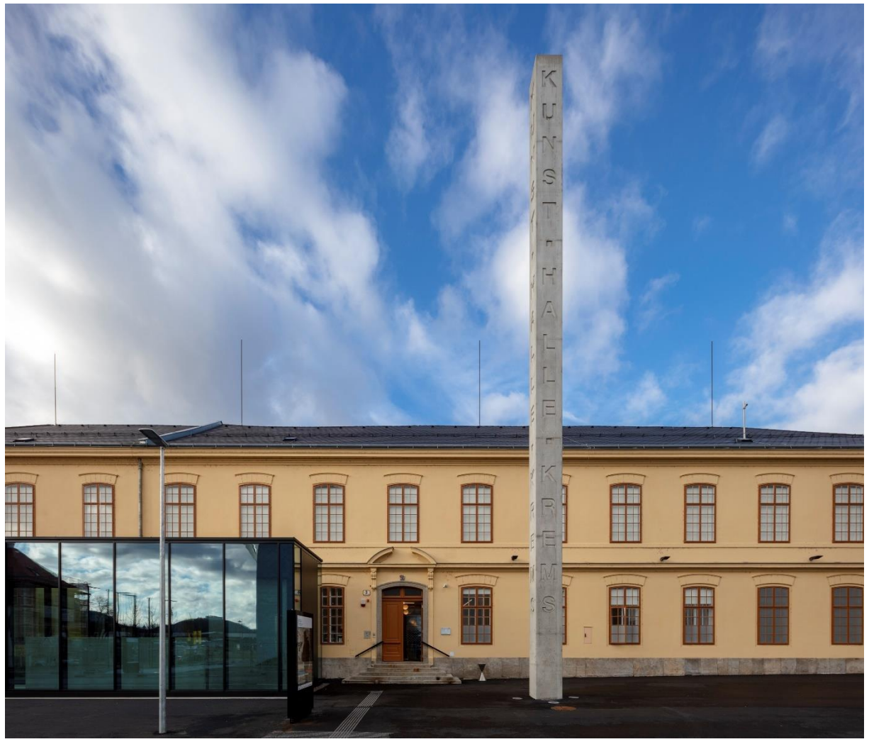
Kunsthalle Krems, 2019