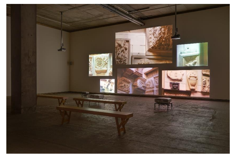
Fiona Tan, Inventory 1, 2012 Installation view at Frith Street Gallery, London