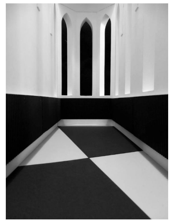
Christian Helwing, Modell für DK-Kirche, 2020 © Christian Helwing VG Bild-Kunst, Bonn 2020