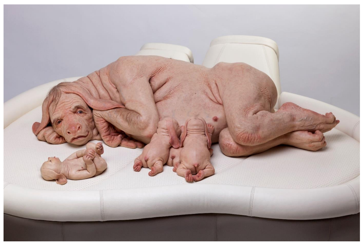
Patricia Piccinini, The Young Family, 2002