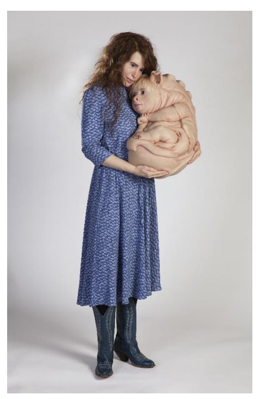
Patricia Piccinini, The Bond, 2016