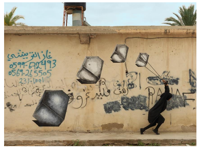
Robin Rhode, Melancholia, 2019 4 C-Prints 54,6 x 72,6 cm