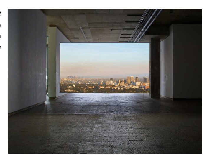
Fiona Tan, Elsewhere 1, 2012 Installation view at Frith Street Gallery, London