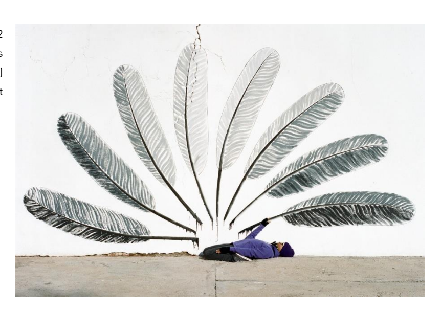
Robin Rhode, Twilight, 2012 8 individual C-prints 41.59 cm x 61.59 cm (framed)