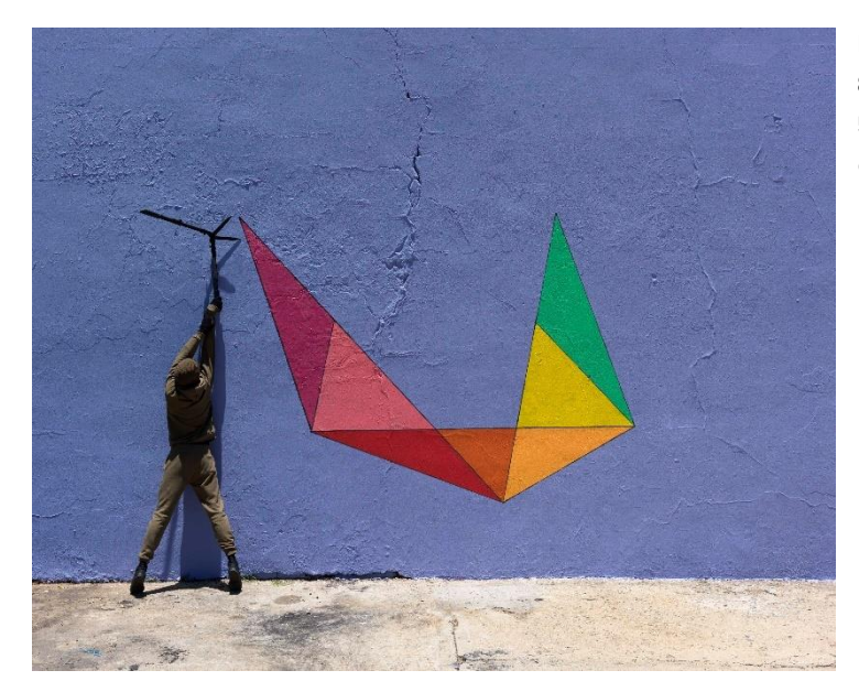
Robin Rhode, Paradise, 2016 8 individual C-prints 56 cm x 70 cm / 58,6 cm x 72,6 cm (framed)