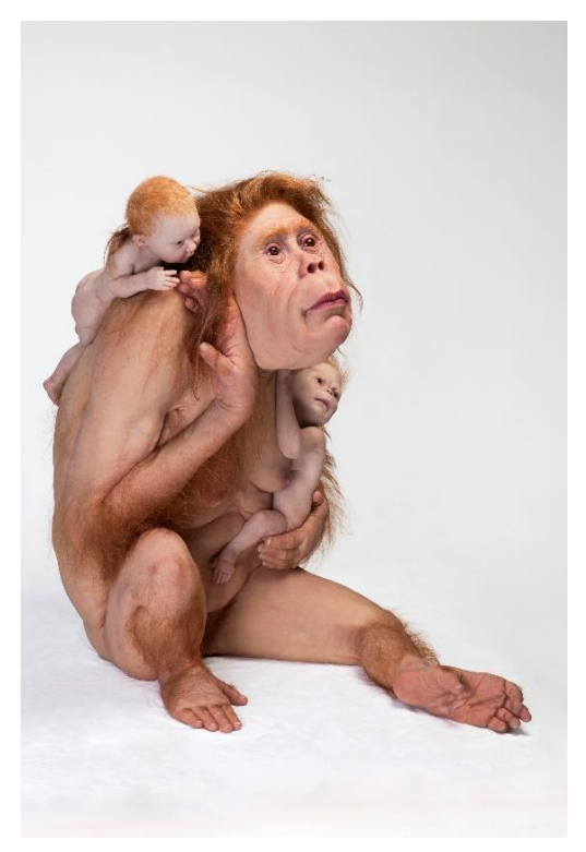
Patricia Piccinini, Kindred, 2018